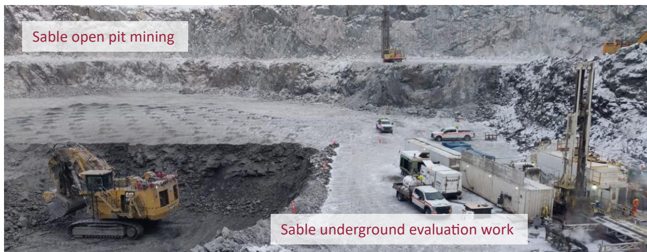
Figure 1 - Sable open pit mining (left) and Sable underground RC drilling program (right).

Tonnes processed in the March quarter were 6% higher than the prior corresponding period in 2023. Carats recovered of 1.2 million carats for the March quarter were down 3% compared to the prior corresponding period in 2023, because of a higher blend of lower grade Sable ore.