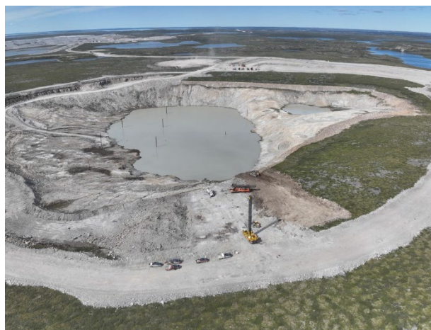
Figure 2 – Point Lake open pit mine preparation for production in early 2025