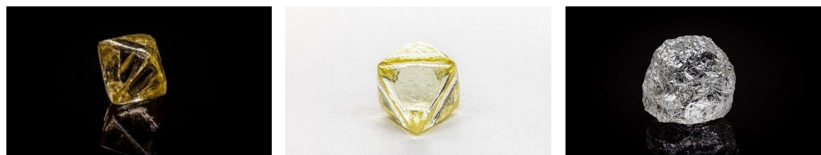
Figure 3 – Selection of diamonds sold during the June quarter. 11.02 carat (left); 23.25 carat (middle); 52.13 carat (right). Sales amount for the three diamonds totalled ~US$1.85M

In the June quarter, the Company concluded three sale events, including one fancy sale. The remaining rough diamond inventory consists of product that is not yet ready for sale but continues to progress through the normal production process managed by the Company.