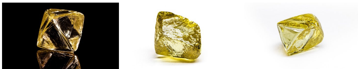
Figure 1 – Selection of fancy – fancy vivid yellow diamonds sold during the December quarter. 11.3 ct (left); 36.0 ct (middle); 14.8 ct (right).

Notes: (1) Diamond inventory is valued at lower of cost or net realisable value, which is not necessarily indicative of its market value.