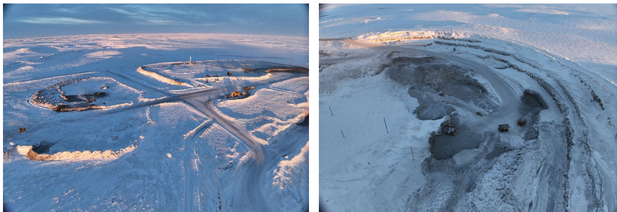
Figure 3 – Point Lake mine preparation for ore production in Q1-2025, showing the waste rock storage area (left) and the upper benches in the open pit (right).